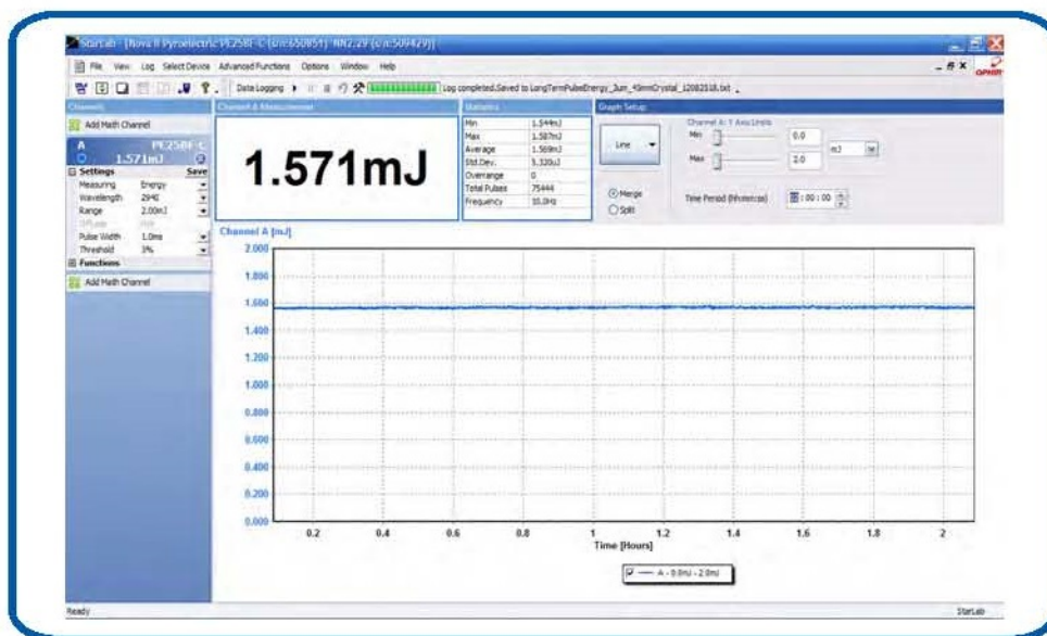
Figure 3. Pulse energy as a function of time showing 0.3% fluctuations over 130 minutes of operation.

Figure 3 shows the pulse energy stability over a 130 minute time span. The diode pumped, single-mode operation enables very low pulse-to-pulse fluctuations. Typical shot-to-shot energy fluctuation is less than 0.5% RMS of the mean pulse energy.